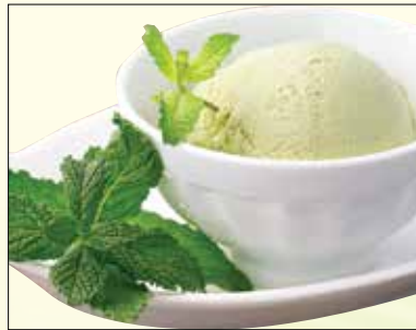
Ice Cream 2.95 Green tea / red bean / vanilla /