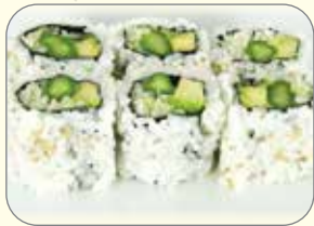
Vegetable California Roll