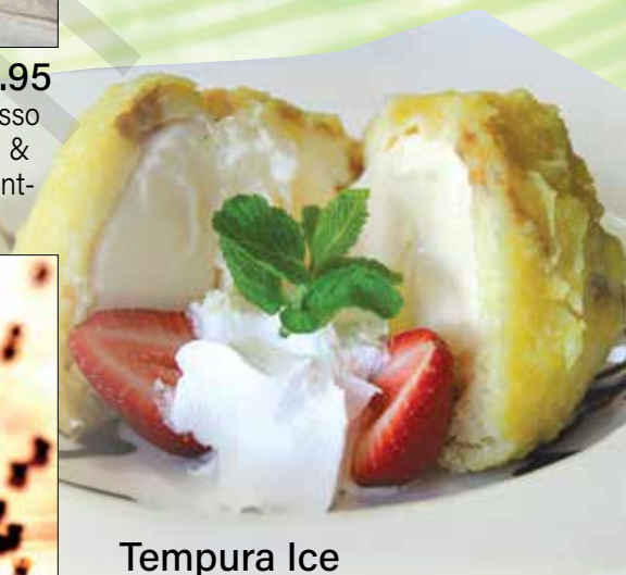
Tempura Ice Cream 4.95 Green tea / vanilla