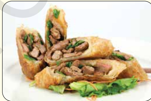
Beef Scallion Pancake