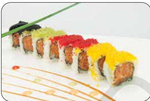
Rainbow Tobiko Roll