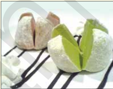
Mochi Ice Cream 3.95 Green tea / red bean / vanilla