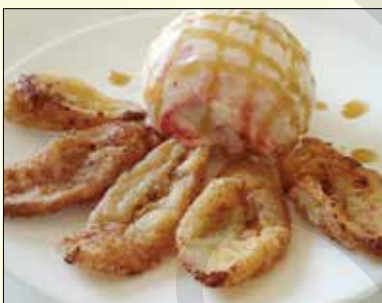
Fried Banana w. Ice Cream 4.95 Red bean / green tea / vanilla /