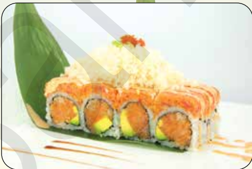
Spicy Girl Roll