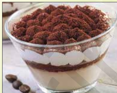
Tiramisu 5.95 Sponge cake soaked in espresso topped w. mascarpone cream & dusted w. cocoa power, presented in glass cup