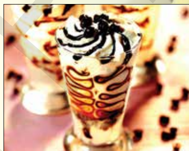
Coppa Caffe 6.50 Latte gelato w. a rich coffee & pure cocoa swirl, presented in a glass cup