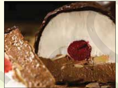
Bomba 5.95 Classic vanilla & chocolate gelato separated by a cherry & sliced almonds covered in cinnamon, finished w. a chocolate coating.