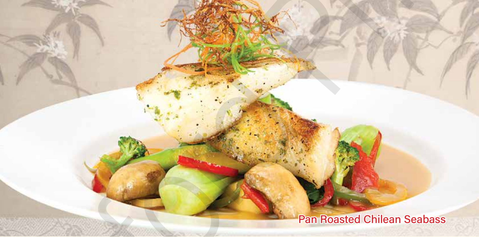
Pan Roasted Chilean Seabass