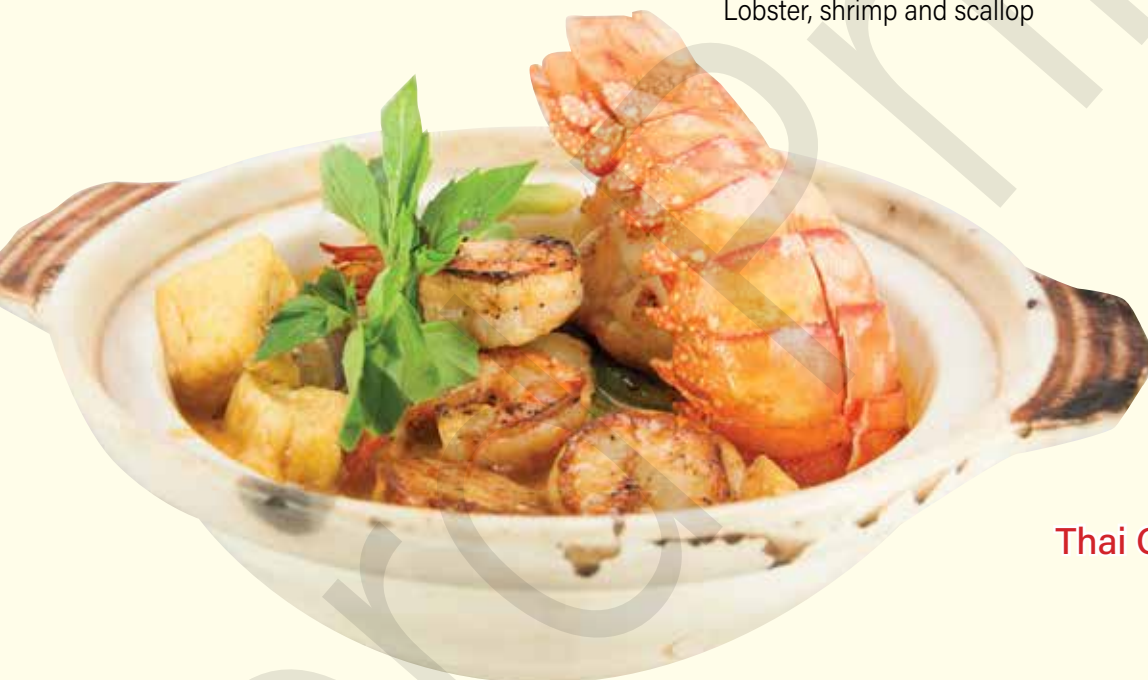
Thai Curry Seafood