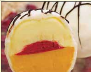
Exotic Bomba 5.95 Mango, passion fruit & raspberry sorbet to all covered in white chocolate & drizzled