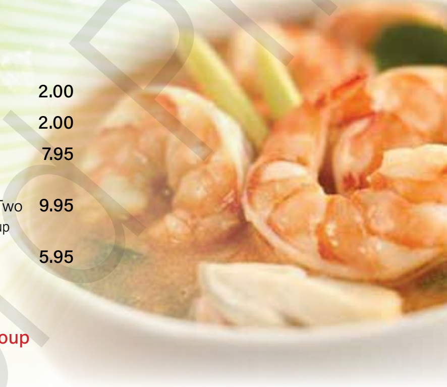
Tom Yam Soup