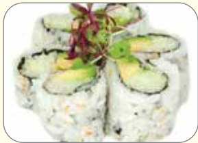
Avocado Cucumber Roll