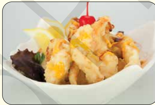
Rock N' Shrimp