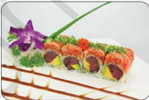
Amazing Tuna Roll

Crunch spicy tuna inside with four kinds of tobiko on top